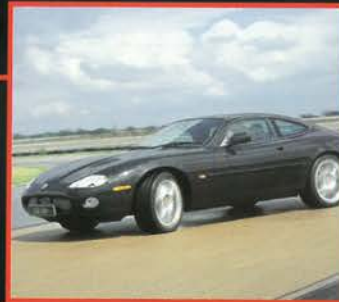
PR_20_02 XKR 100 COUPE TEST TRACK DEMO