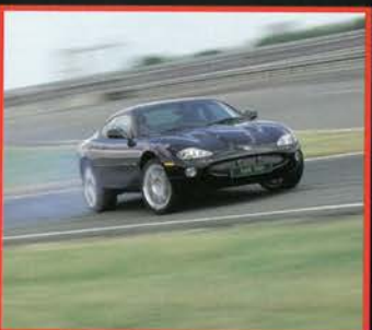
PR_19_02 XKR 100 COUPE TEST TRACK DEMO