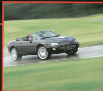
PR_28_02 XKR 100 CONVERTIBLE TEST TRACK DEMO