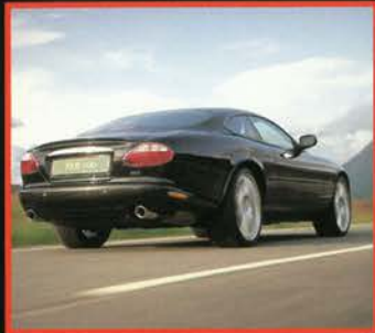
PR_21_02 XKR 100 COUPE