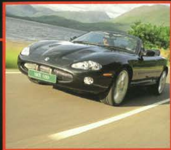
PR_18_02 XKR 100 CONVERTIBLE