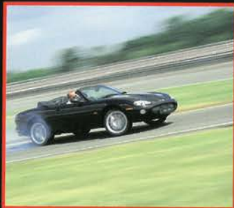
PR_29_02 XKR 100 CONVERTIBLE TEST TRACK DEMO