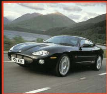
PR_22_02 XKR 100 COUPE