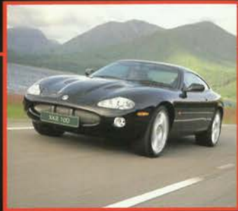
PR_23_02 XKR 100 COUPE